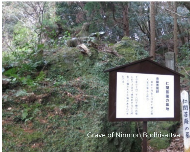
Grave of Ninmon Bodhisattva