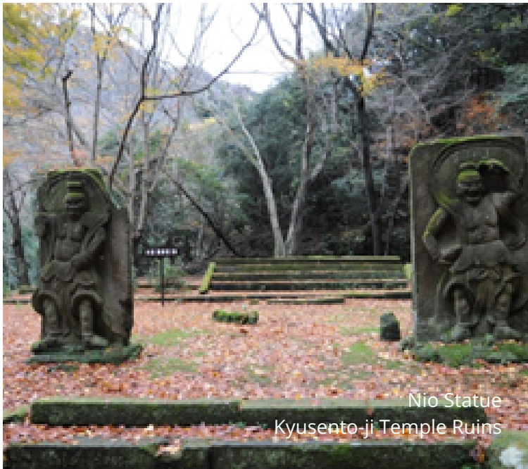
Nio Statue Kyusento-ji Temple Ruins