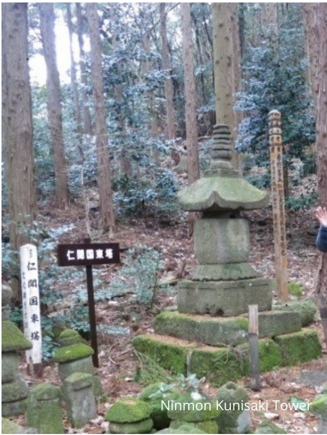
Ninmon Kunisaki Tower