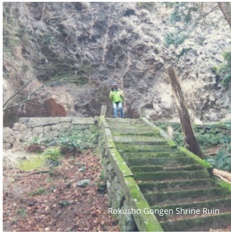
Rokusho Gongen Shrine Ruin